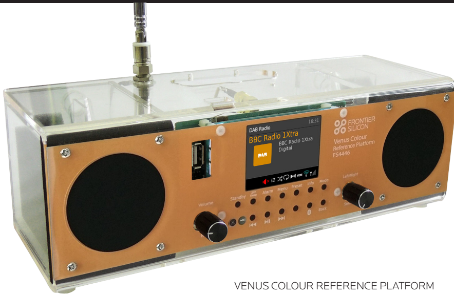
VENUS COLOUR REFERENCE PLATFORM