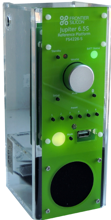
JUPITER 6.5S REFERENCE PLATFORM