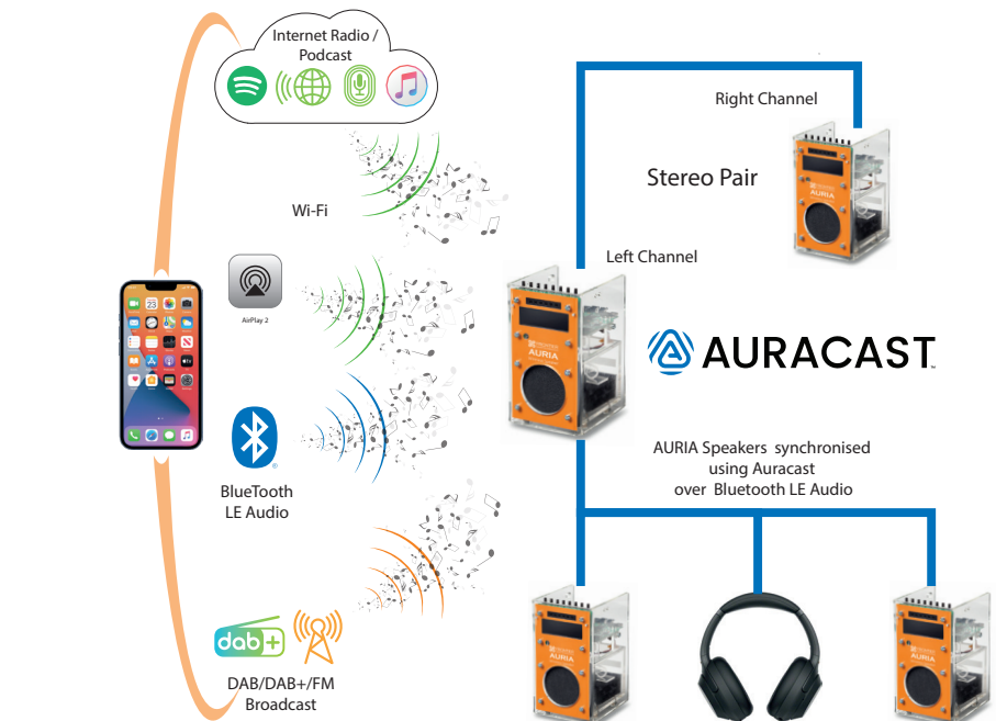
WIDE RANGE OF CONNECTIVITY OPTIONS

Designed with security and privacy in mind and to be fully compliant with UK / EU cyber security laws coming into force.